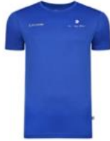
Technical T-Shirt - Reflex Blue £ 25.00