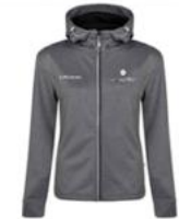
Womens Full Zip Hoodie - Charcoal Heather £ 50.00