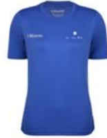
Womens Technical T-Shirt - Reflex Blue £ 25.00