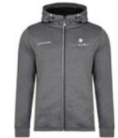
Full Zip Hoodie - Charcoal Heather £ 50.00