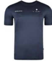
Technical T-Shirt - Kukri Navy £ 25.00