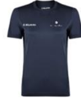
Womens Technical T-Shirt - Kukri Navy £ 25.00