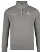
Mens 1/4 Zip Track Top - Ch Marl £ 45.00