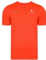
Technical T-Shirt - Flouro Red £ 25.00